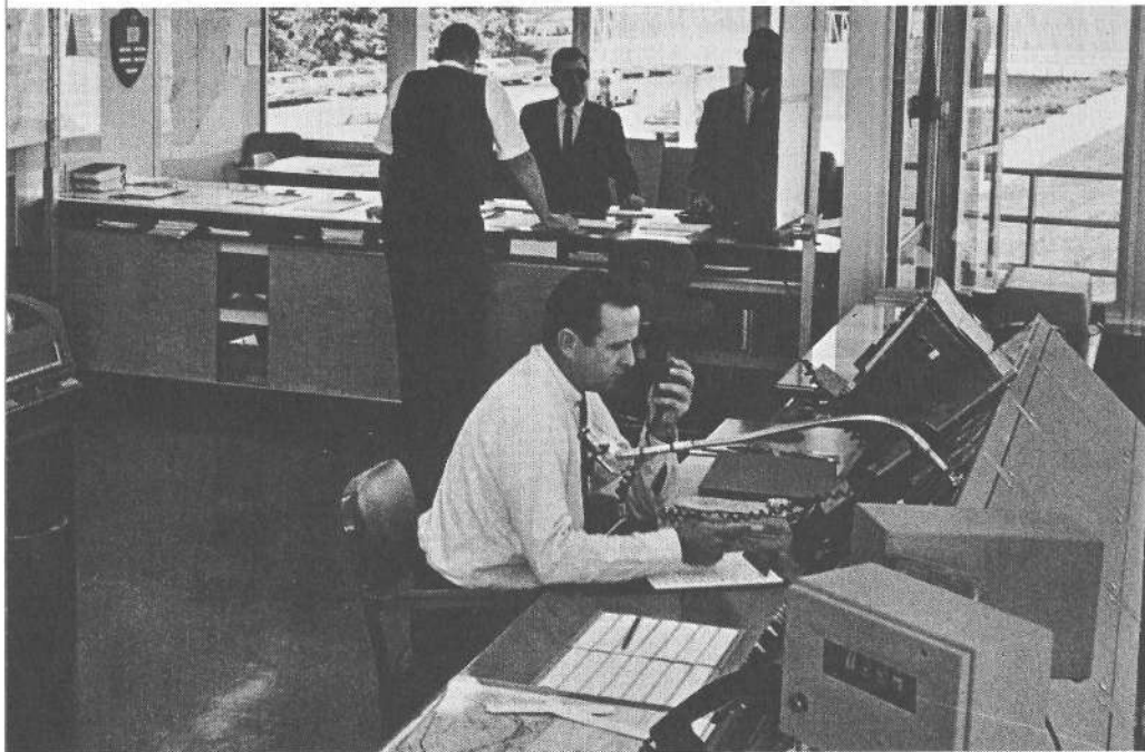
Specialists in FAA's 300 flight service stations primarily service the general aviation fleet of private, business and recreational aircraft by providing pertinent information on weather, airports, altitudes, and other flight-planning data to more than 700,000 pilots.

Candidates for air traffic control work are recruited locally at FAA field offices and trained at the Aeronautical Center in Oklahoma City. It is a career with a challenging future.