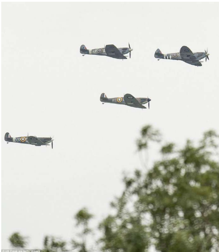
A group of four Spitfires zoom past, as they complete their anniversary journey with a fly-past at Biggin Hill in south London