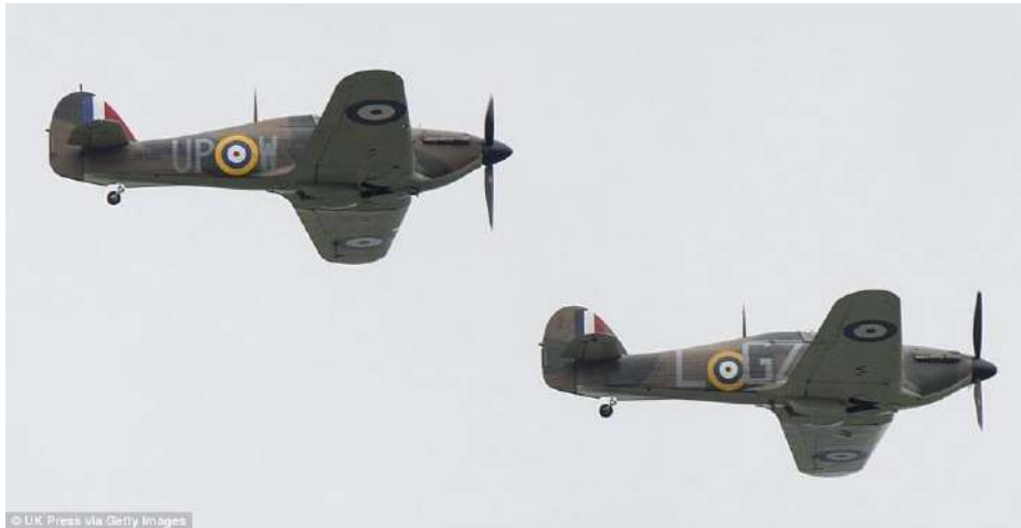
These two Hurricanes were part of the afternoon fly-past across southern Britain