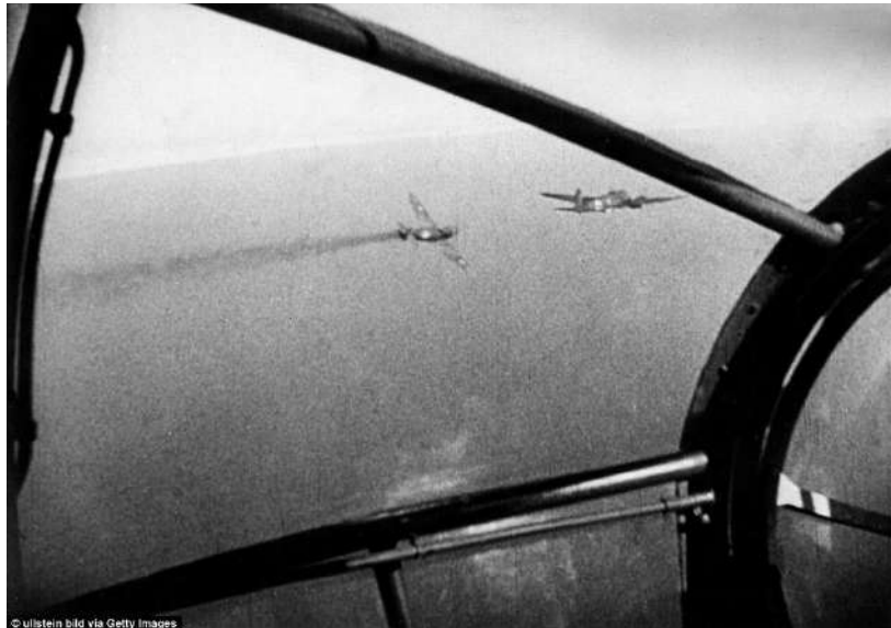
This image shows an RAF Hurricane trailing smoke while it attempts to attack a Heinkel 111 bomber over the English Channel