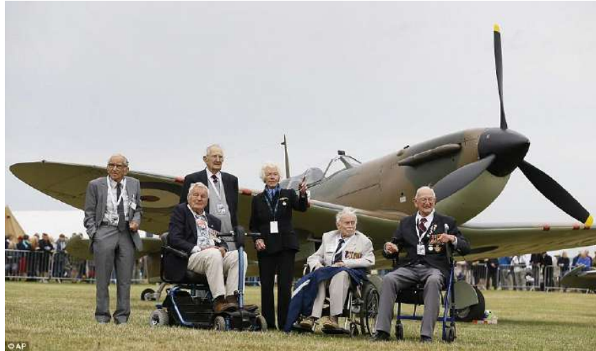
Veterans gather by a Spitfire at the commemoration day of the Battle of Britain, at Biggin Hill airport in Kent. It was the airborne fight that saved Britain from falling to the Nazis