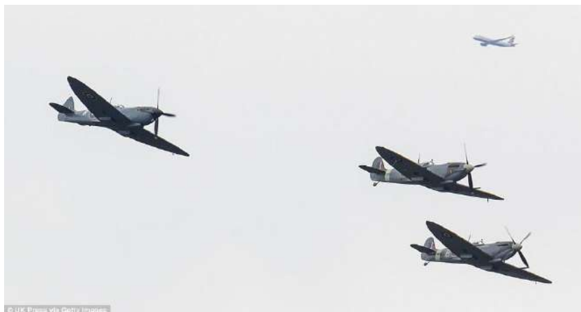
After their flights, the aircraft today returned to Biggin Hill for several fly pasts, before a lone Spitfire performed a victory roll over the crowd and runway