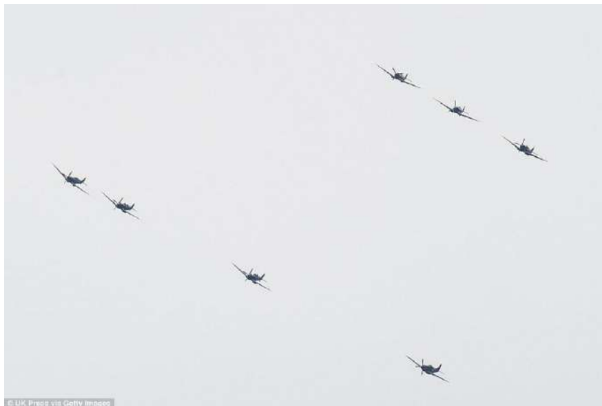
The iconic aircraft flew in formation - just like their heroic pilots would have to take on the German air force during the famous battle