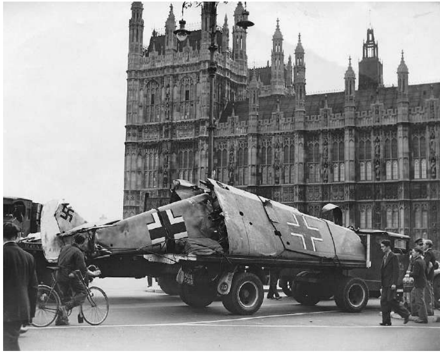
Some of the aircraft, such as this Messerschmitt Bf 109 were destroyed only yards away from iconic locations in London, pictured