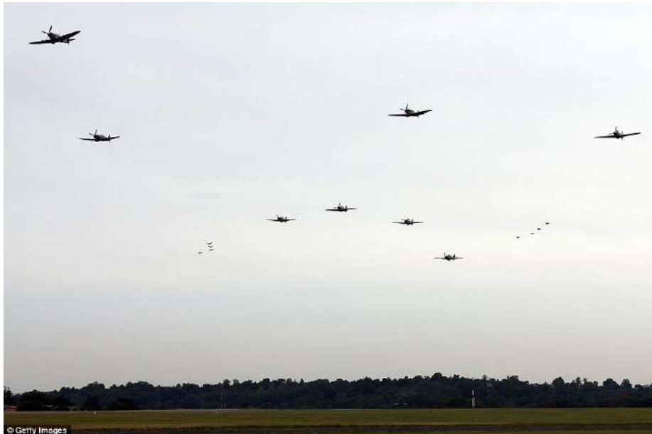
A stream of Spitfire aircraft fly through the skies over south east England in commemoration of the Battle of Britain 75 years on