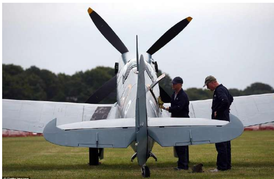
Many of the planes - including this pristine Spitfire - have been lovingly restored by experts, costing as much as £2million a time