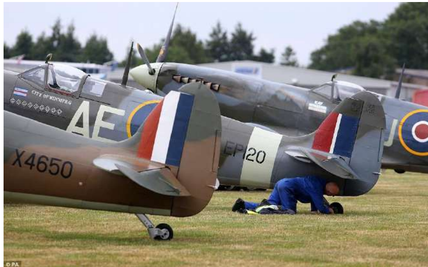
An engineer ensures that one of the Spitfires is ready for take-off. In total, 24 restored aircraft joined in today's commemoration