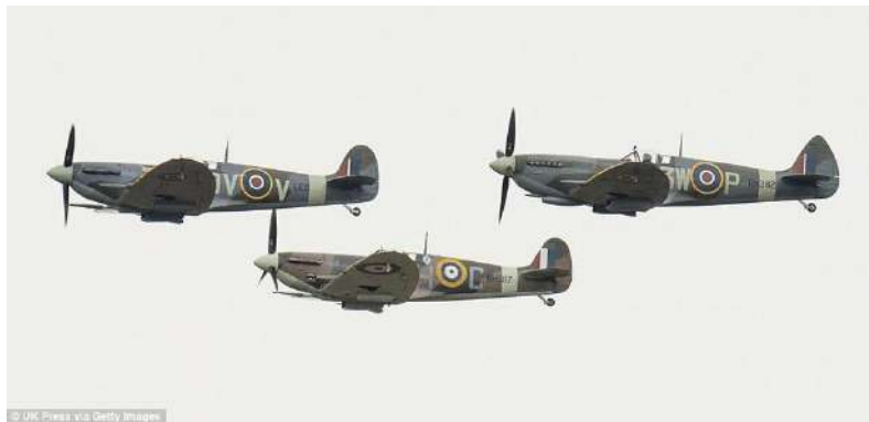
At the end of the day's battle, the RAF had lost 68 planes. However, the Luftwaffe lost more, with 69 of their aircraft destroyed