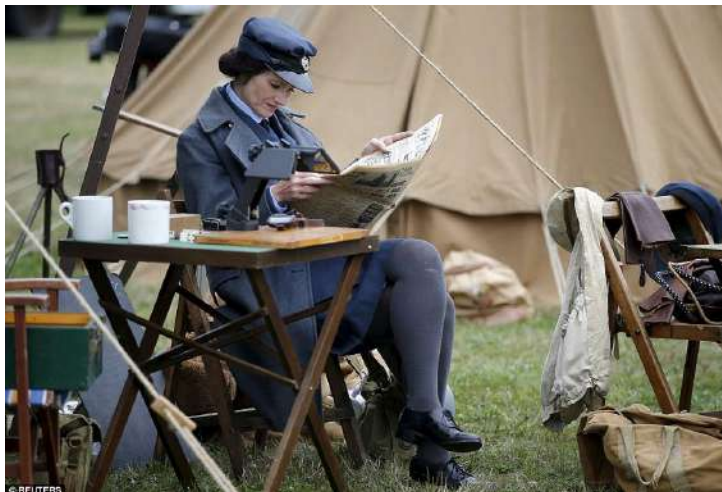
A large group of re-enactors dressed up in period uniforms as part of today's commemoration of the Hardest Day