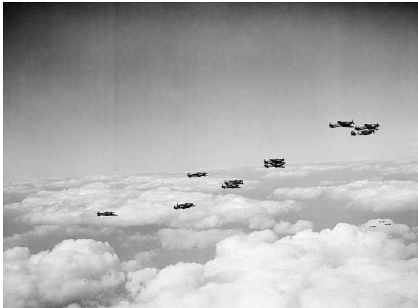
RAF ace Douglas Bader created his idea of a 'Big Wing' pictured, to cause maximum damage to attacking Luftwaffe aircraft