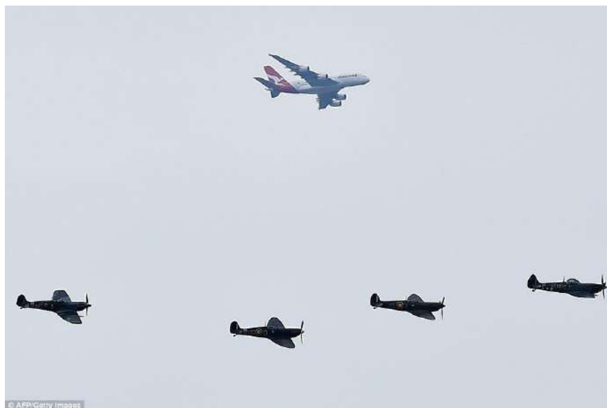
The ancient Spitfire aircraft show that they are more than still capable in the skies, taking on this huge Qantas Airbus A380 - or so it would appear