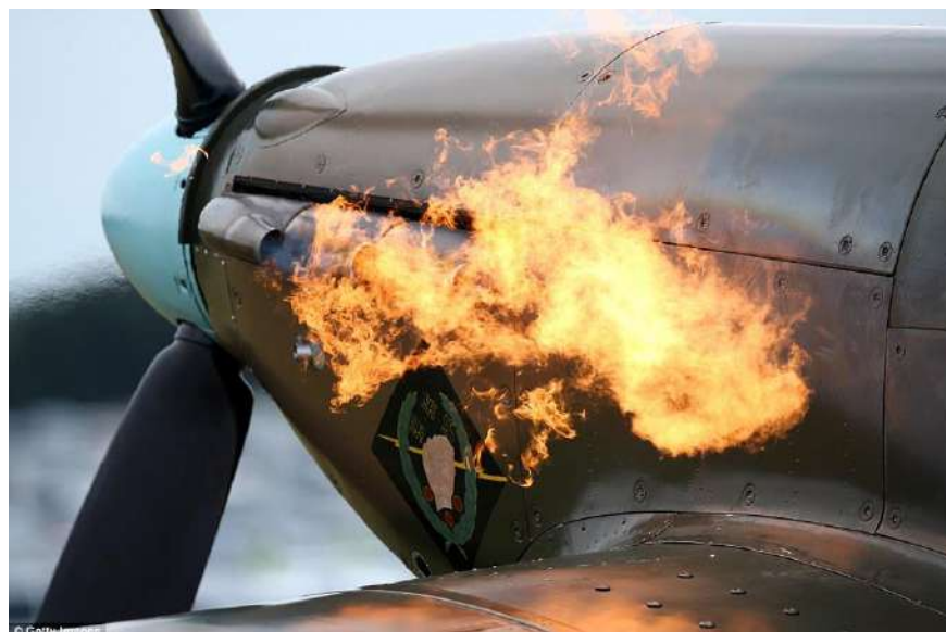
Flames lick from the exhaust of a stunning, remodeled Hurricane as its engine is started.