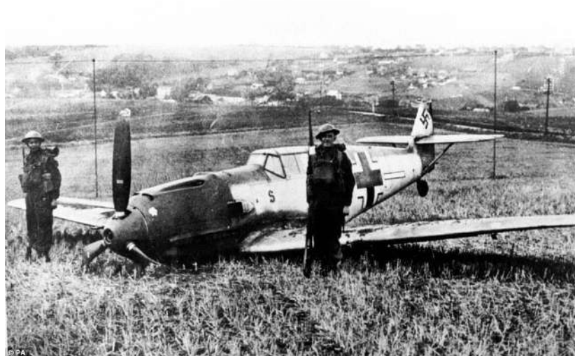
The pilot of this Messerschmitt Bf109E managed to crash land after being forced from the sky during the Battle of Britain